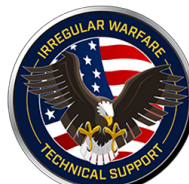
ASW SO/LIC Capability, Development & Innovation Office