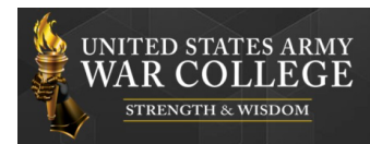
U.S. Army War College