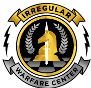
Irregular Warfare Center