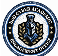
DoW CIO Cyber Academic Engagement Office